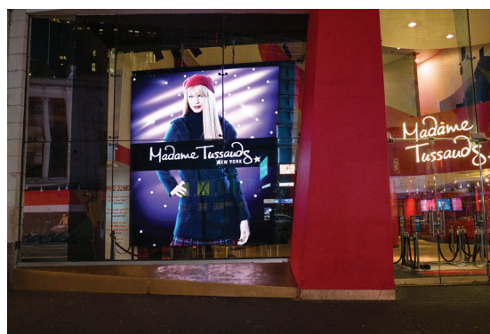
The exterior of Madame Tussaud's Museum in New York City is an example of technology integrated with design to create a compelling customer experience.