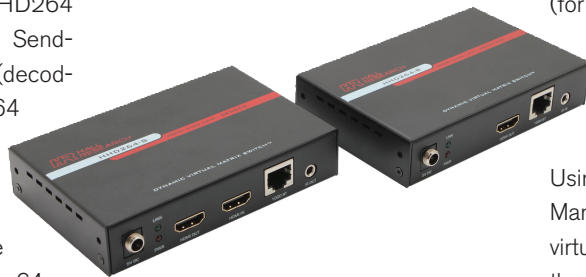
Hall Research's HHD264 Sender (left) and Receiver

An important feature of the system is its ability to switch Receivers on the fly to show the video of any Sender on