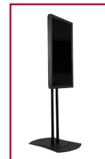
Single display Portrait