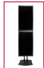
Dual Display Portrait (requires ACC604 adaptor)