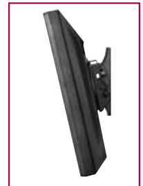
Low-profile design holds display only 1.58" (40mm) from the wall