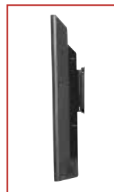
Low-profile design for a sleek, yet compact installation

Please visit peerless-av.com/en-us/patents for patent information.