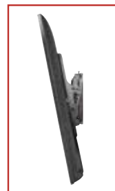
+15°/-5° of tilt for versatile viewing angles