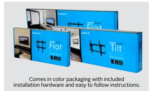
Comes in color packaging with included installation hardware and easy to follow instructions.